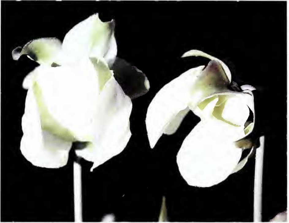
Figure 4: Sarracenia 'Sorrow'.